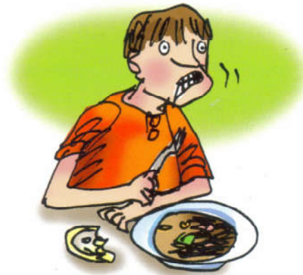
chew the stew

3. fire , hire , wire , spire , bonfire , inspire , conspire