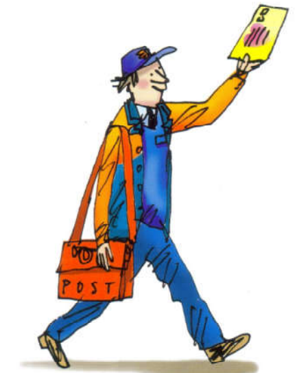
a better letter

3. toad , oak , road , cloak , throat , roast , toast , loaf , coat , coal , coach