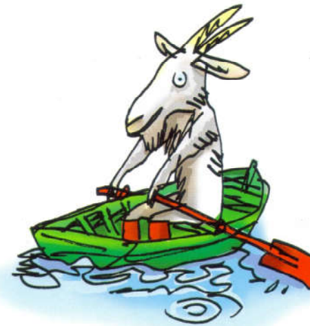
goat in a boat

3. new , knew , flew , blew , few , crew , newt , screw , drew , grew , stew