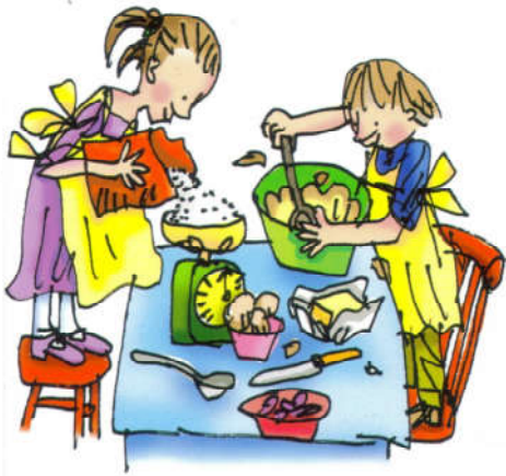
make a cake

3. make , shake , cake , name , same , game , save , brave , late , date