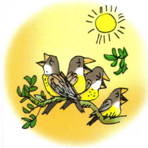
yawn at dawn

3. eat , tea , neat , real , clean , please , leave , dream , seat , scream