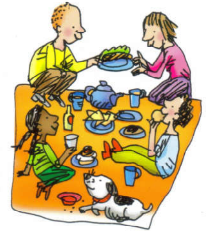
care and share

3. burn , turn , lurk , hurl , burn , burp , slurp , nurse , purse , hurt