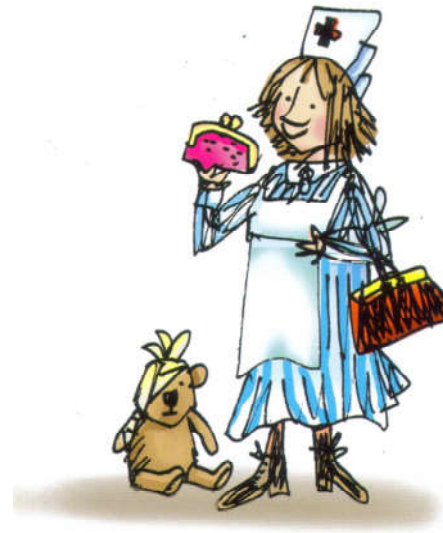
nurse with a purse

3. howl , how , down , brown , cow , town , crowd , drown , now , gown