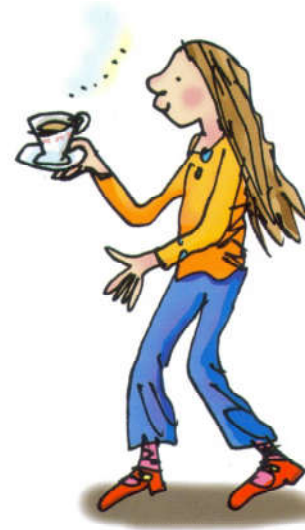
cup of tea

3. eat , tea , neat , real , clean , please , leave , dream , seat , scream