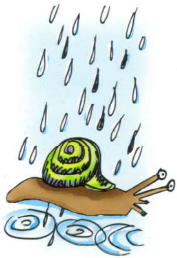
snail in the rain

3. paid , snail , tail , drain , paint , Spain , chain , train , rain , stain