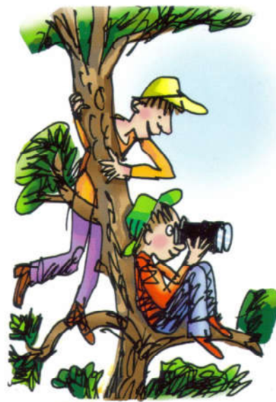
what can you see ?

2. high , night , light , fright , bright , sight , might