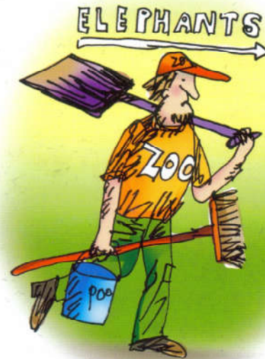
poo at the zoo

2. took , look , book , shook , cook , foot