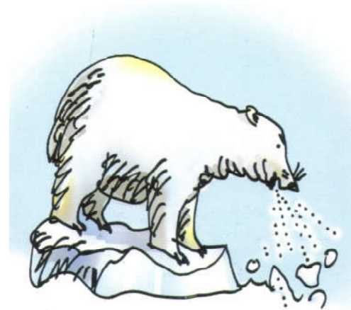
blow the snow

2. too , zoo , mood , fool , pool , stool , moon , spoon