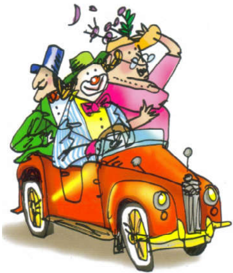
start the car

2. day , play , may , way , lay , say , tray , spray