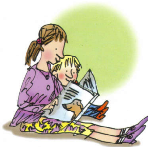
look at a book

2. car , bar , star , park , smart , start , sharp , spark