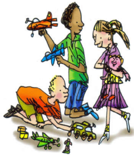
may I play?

2. see , three , been , green , seen , keep , need , sleep , feel