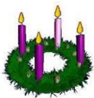
The Advent Wreath