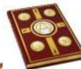
Book of the Gospels