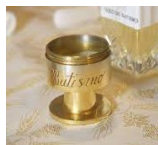
OIL OF CHRISM

All of these artefacts are used in the sacrament of Baptism to help welcome the baby.